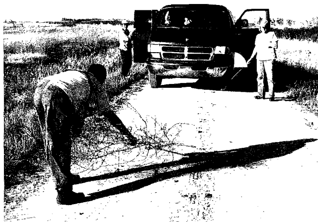
Judy, the Snake Wrangler!